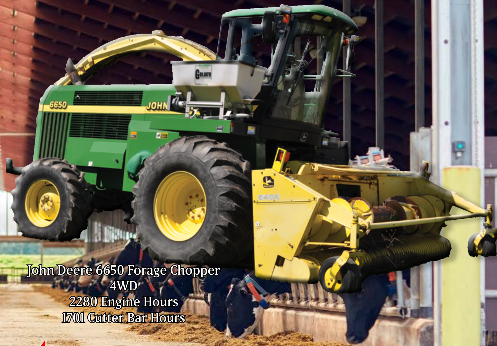
John Deere 6650 Forage Chopper 4WD 2280 Engine Hours 1701 Cutter Bar Hours