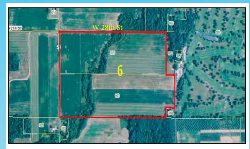
Parcel 6 - Section 20 On Fitzgerald just North of 32nd