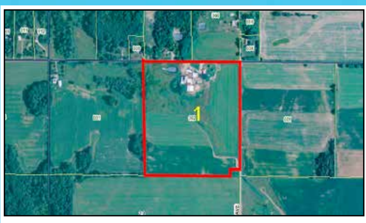
Parcel 1- Section 29 Main Dairy Setup and Home 8496 W 32nd St., Fremont, MI 49412