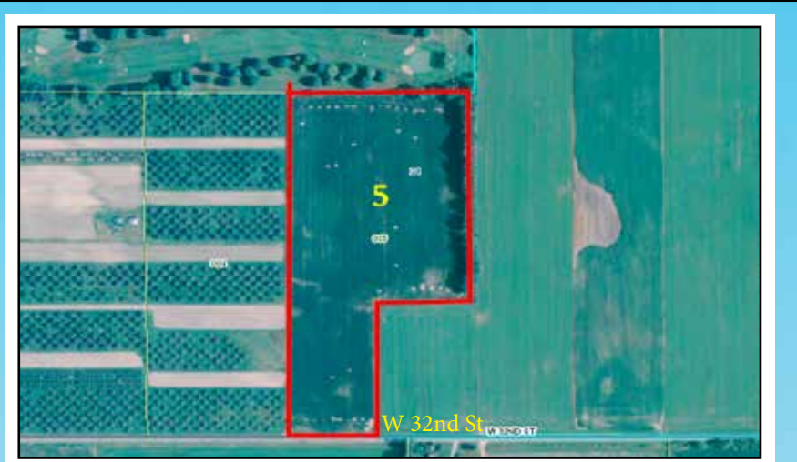
Parcel 5 - Section 21 On 32nd East of Comstock

Farm Location: 8496 W 32nd St., Fremont, MI 49412