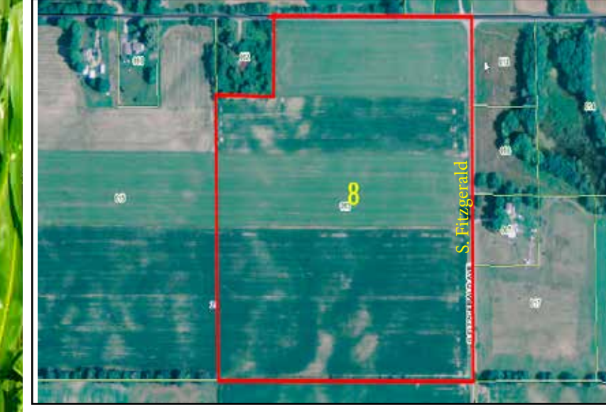
Parcel 8 - Section 20 On SW Corner of Fitzgerald & W 24th